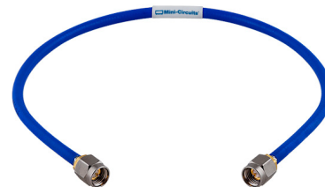
CASE STYLE: KQ1506-XX