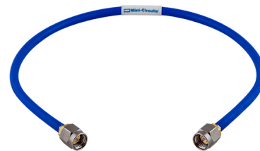
CASE STYLE: KQ1506-12