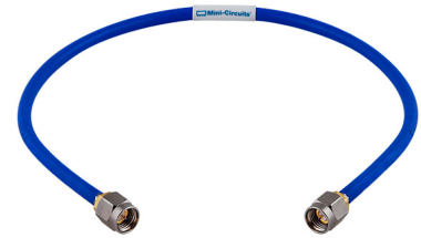
CASE STYLE: KQ1506-XX